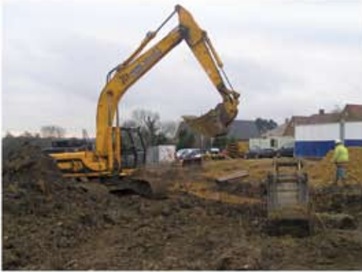
When will the diggers move in?

This issue of the Thakeham Oak is to update everyone with what is happening with the mushroom farm and proposed new housing estate.