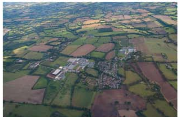
Aerial View of Thakeham as it is today

Costs for judicial review are not as great as you may imagine. TVA has also been looking at what financial help can be found. As soon as we know that a decision notice has been issued, Thakeham Village Action will launch the judicial review challenge and also ask members and supporters for any donations that can be offered in the form of refundable donations, to be returned should we win (as we expect to).